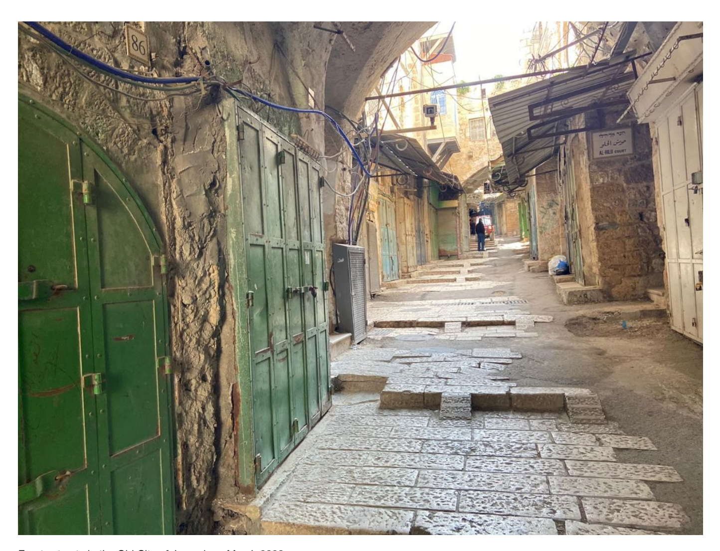
Empty streets in the Old City of Jerusalem, March 2020.

Palestinian merchants in the old city express their desperation as the COVID-19 pandemic cancels the high season of Easter in Jerusalem. Shops are closed, hotels are empty and thus firing staff, and business owners face the unforeseen future of their small businesses.