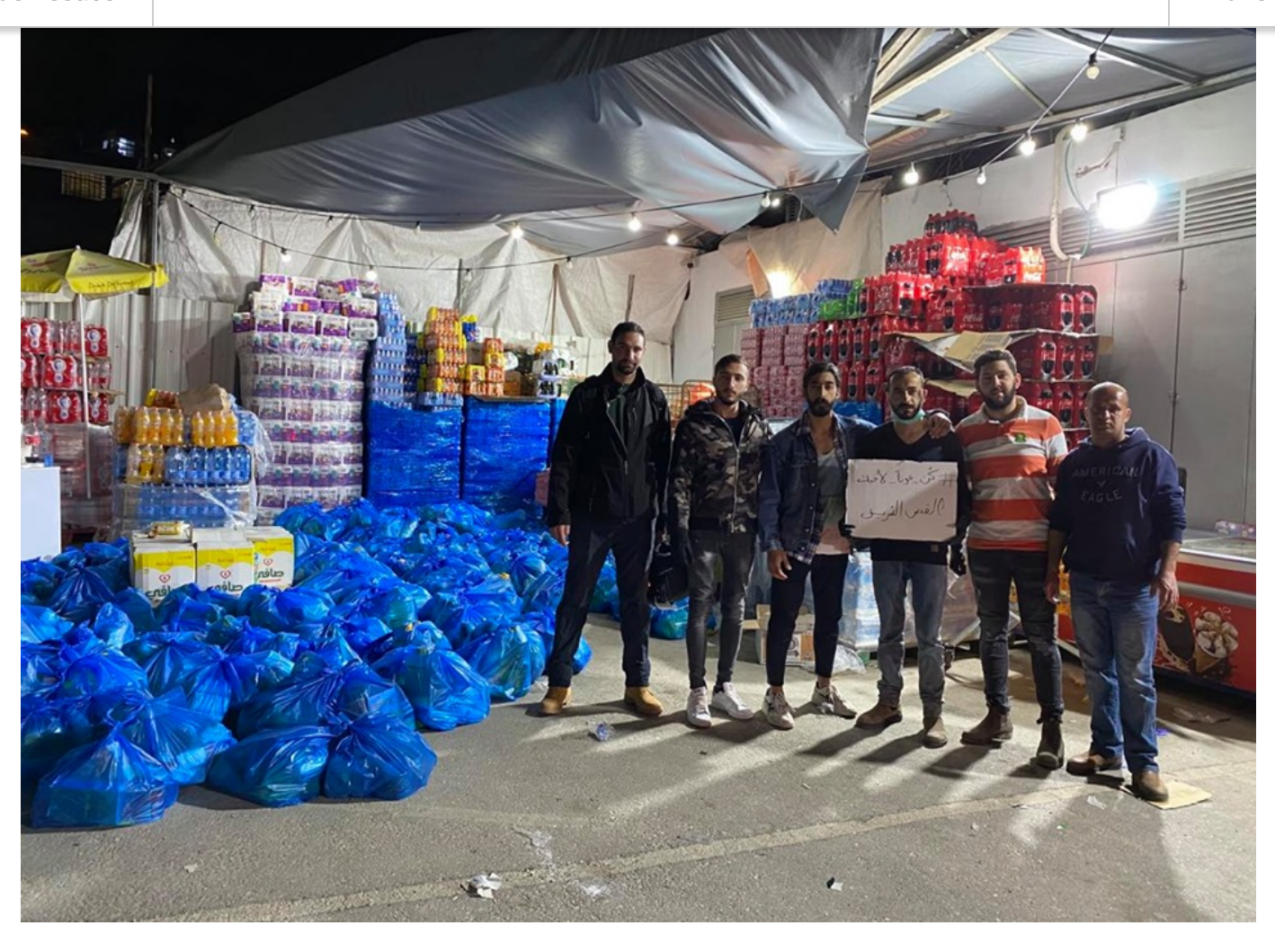
The initiative volunteers at the beginning of the campaign, March 2020.

The campaign did not stop at the colonial borders dividing Jerusalem, and families on both sides of the Wall, and on both sides of the Israeli dictated Jerusalem municipal boundaries were supported: Shuafat and the Shuafat refugee camp, Beit Hanina, Sur Baher, Al-Tur, Anata and Al-Thori. It also included some of the villages of Bethlehem, such as Al-Ubeidiyah, to the south of Jerusalem.